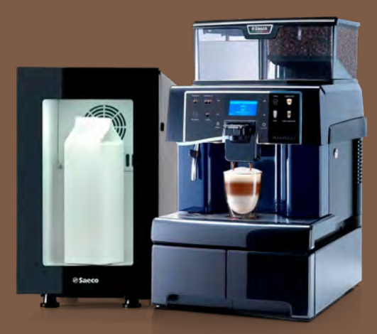
TABLE-TOP & FLOORSTANDING